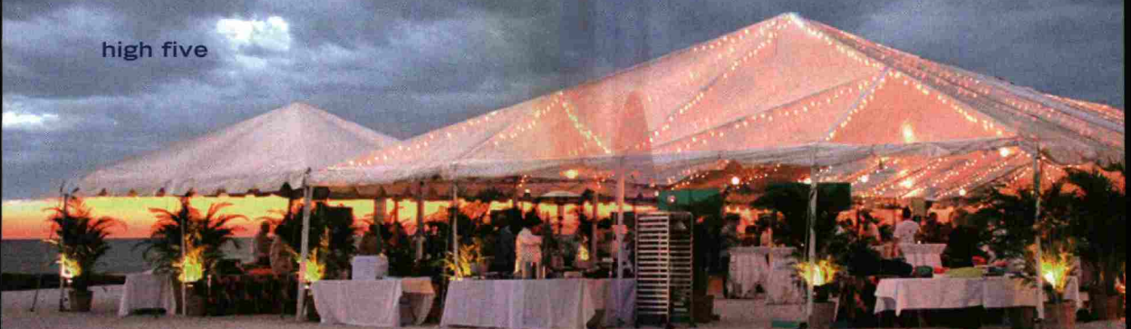
Stone Crab, Seafood & Wine Festival, Longboat Key, Florida